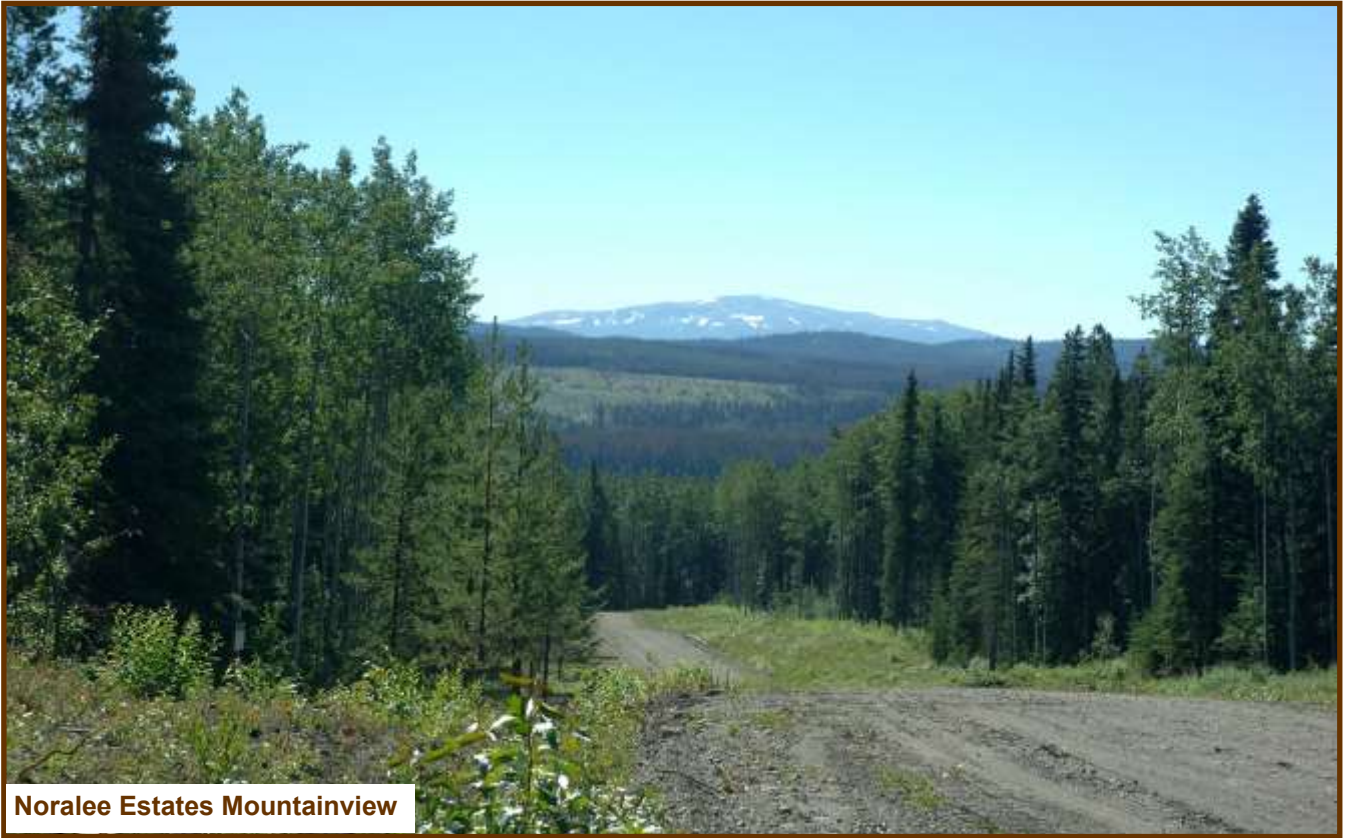
Noralee Estates Mountainview