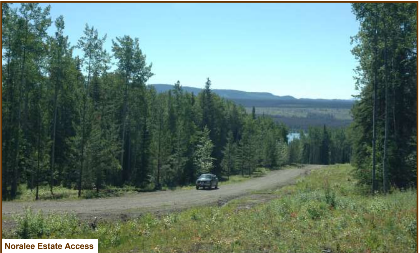
Noralee Estate Access

Contact us: sales@niho.com or 604-606-7900