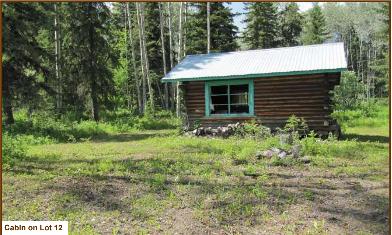
Cabin on Lot 12

Contact us: sales@niho.com or 604-606-7900